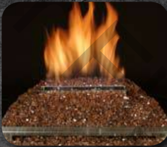
20" SS Chassis with Copper Glass

The wedge-shaped chassis of the high-efficiency burner system as well as the firebox floor is covered with the special glass to create an alluring presentation. For the minimalist the chassis/burner alone may be used for a pure flame effect.