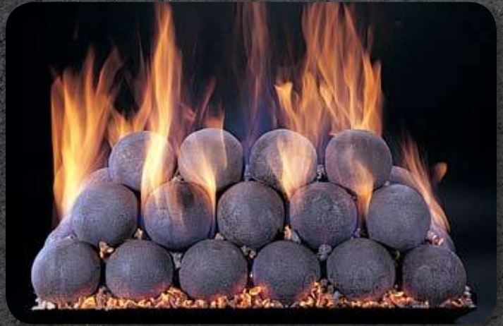
Brown 4" FireBalls on CS Burner

Individual FireBalls™ are available in 2", 2.5", 3", 4", 6", 7" and 8" diameters, as well as 4", 6" and 7" half-balls.