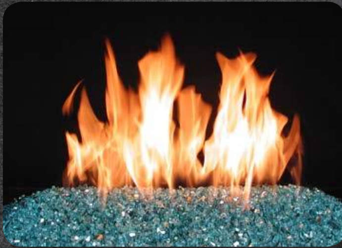
FireGlitter Burner with Blue-Green Glass

A special linear burner creates a line of fire that rises through the bed of glass. The dancing flame is reflected in the face of each glass crystal, creating a very dynamic and thoroughly engaging display.