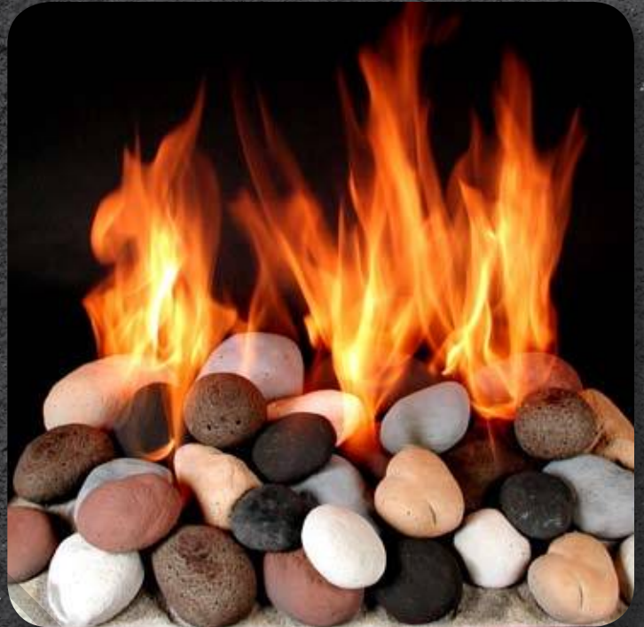
Calico FireStones on 24" CXF Burner

FireStones™ are available in specific set sizes and in assortment packs in extra large, large, medium, small and pebble sizes.