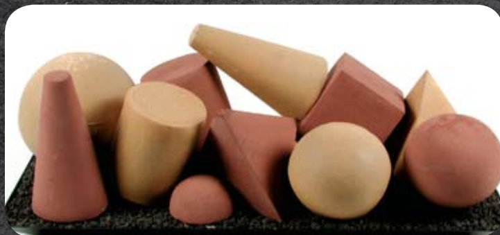
Large FireShapes in Beige and Adobe Red Colors

Individual FireShapes™ include two sizes each of Cones, Cylinders, three and four-faced Pyramids and Cubes, as well as Spheres and Half-Spheres. Colors can be mixed and matched to complement décor.