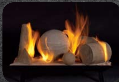
Mixed FireShapes in Natural Color