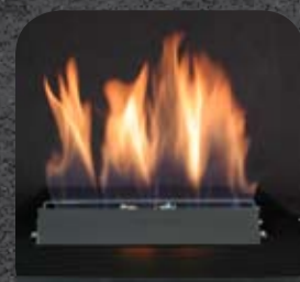
Vent-free 24” Black Chassis

All ALTERNA Vent-Free Systems feature a single opposed-louver lance-port burner for ultimate heat and appearance. Models available for both single-sided and see-through fireplaces.