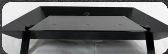
Vented CS Burner

Burners are the heart of each ALTERNA set. Vented burners create a full, luminous flame, while vent-free burners produce a concentrated, efficient fire. All sizes and styles of ALTERNA burners are available in Black or Stainless Steel Finish. While Vent-free burners are limited to 20”, 24” and 30” sizes, Vented burners are available in sizes to fit virtually any fireplace.