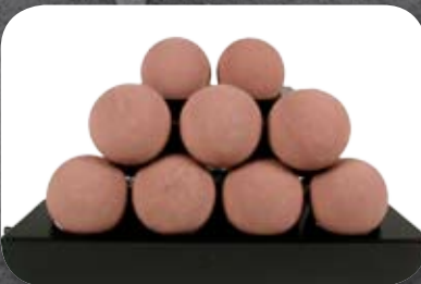
Adobe Red FireBalls on 20" Black Burner Chassis