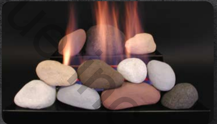
Calico FireStones on 24" Black Burner Chassis

Single-sided sets have three rows of FireStones™ while See-Thru sets have two on each side. Single color and color combinations are available to beautifully complement the fireplace and room design.