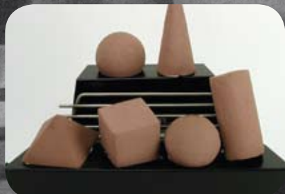
20" Adobe Red FireShapes on Black Burner Chassis