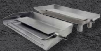
Burners in Stainless Steel