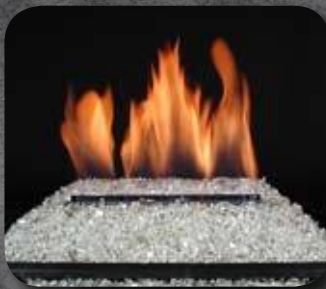
24" Black Chassis with Platinum Glass