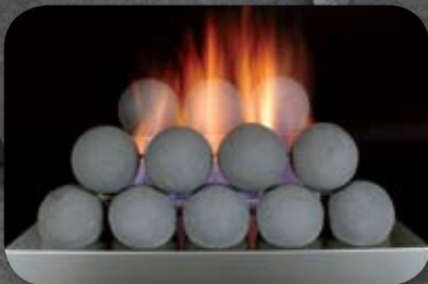
Dark Gray FireBalls on 24" Stainless Steel Burner Chassis