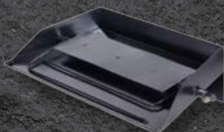
Vented CXF Burner

BLACK FINISH CHASSIS - In a darkened fireplace, the black chassis fades into the background while accentuating the objects and the flame.