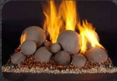
Mixed Size FireBalls in Natural Color on CXF Burner