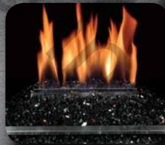
24" Stainless Steel Chassis with Black Glass