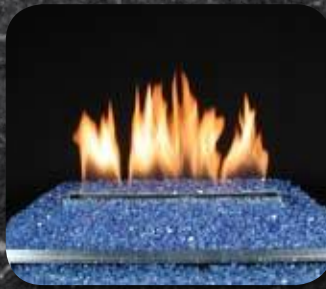
30" Stainless Steel Chassis with Cobalt Glass