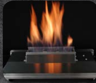
20" Double-Faced SS Chassis