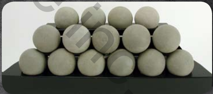
Natural FireBalls on 30" Black Burner Chassis

The flame of the See-Thru sets emanates from the middle of the four tiers (two on each side).