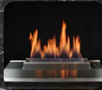
30" Double-Faced SS Chassis