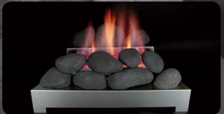
Black FireStones on 24" Stainless Burner Chassis