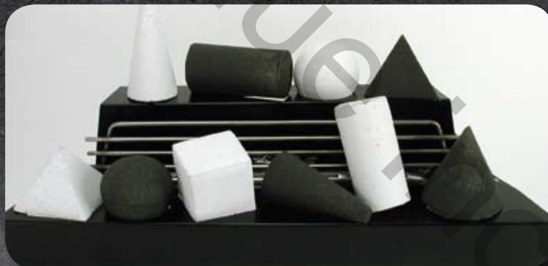
30" Black and White FireShapes on Black Burner Chassis

See-Thru sets have two rows of FireShapes™ with flame between the two. Single colors or combinations of colors can be used to create that perfect look.