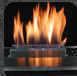
Double Faced Vent-free 24” Stainless Steel Chassis