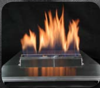
24" Stainless Steel Chassis