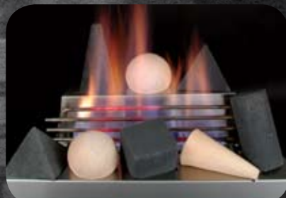
24" Black and Beige FireShapes on Stainless Steel Burner Chassis