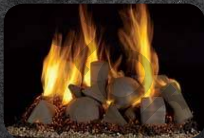
Small FireShapes in Natural Color