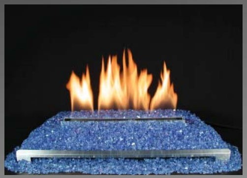
30" SS Chassis with Cobalt Blue Glass