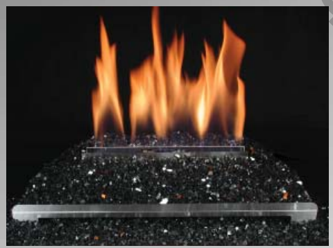
24" SS Chassis with Black Glass