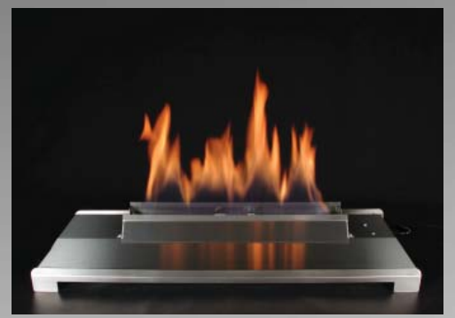
30" DF SS Chassis - no Glass