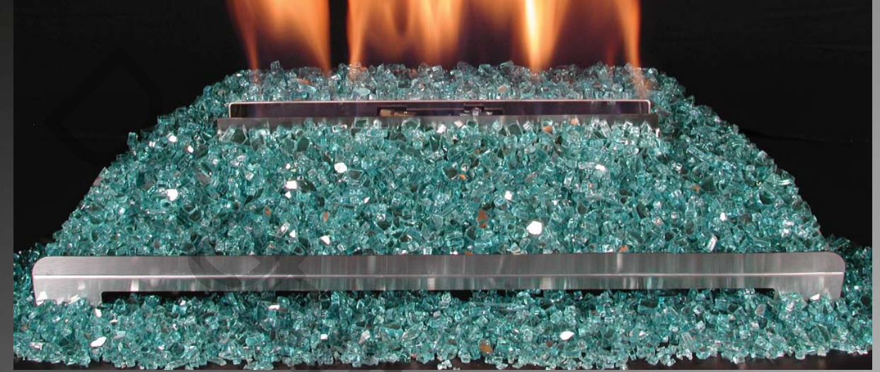
24" Stainless Steel Chassis with Blue/Green Glass