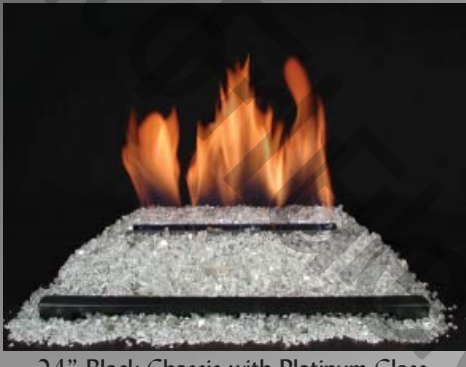
24" Black Chassis with Platinum Glass