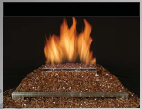
20" SS Chassis with Copper Glass