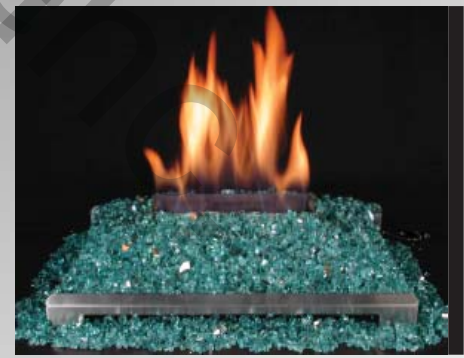
20" DF SS Chassis with Blue/Green Glass