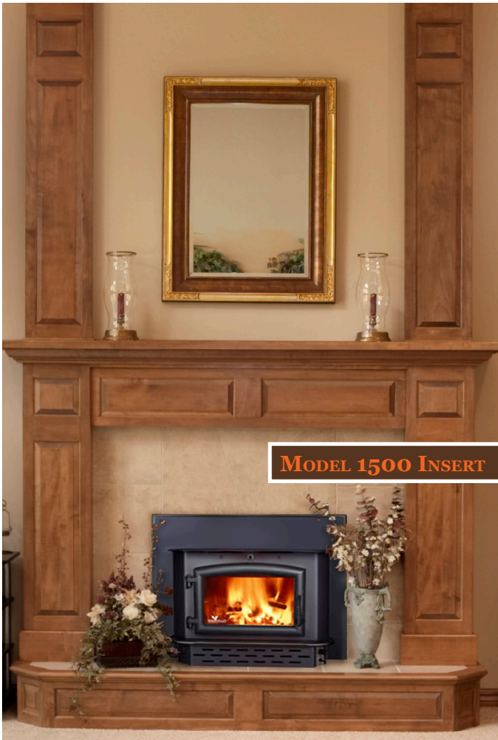
MODEL 1500 INSERT

High Valley STOVES by: Stoll quality . tradition