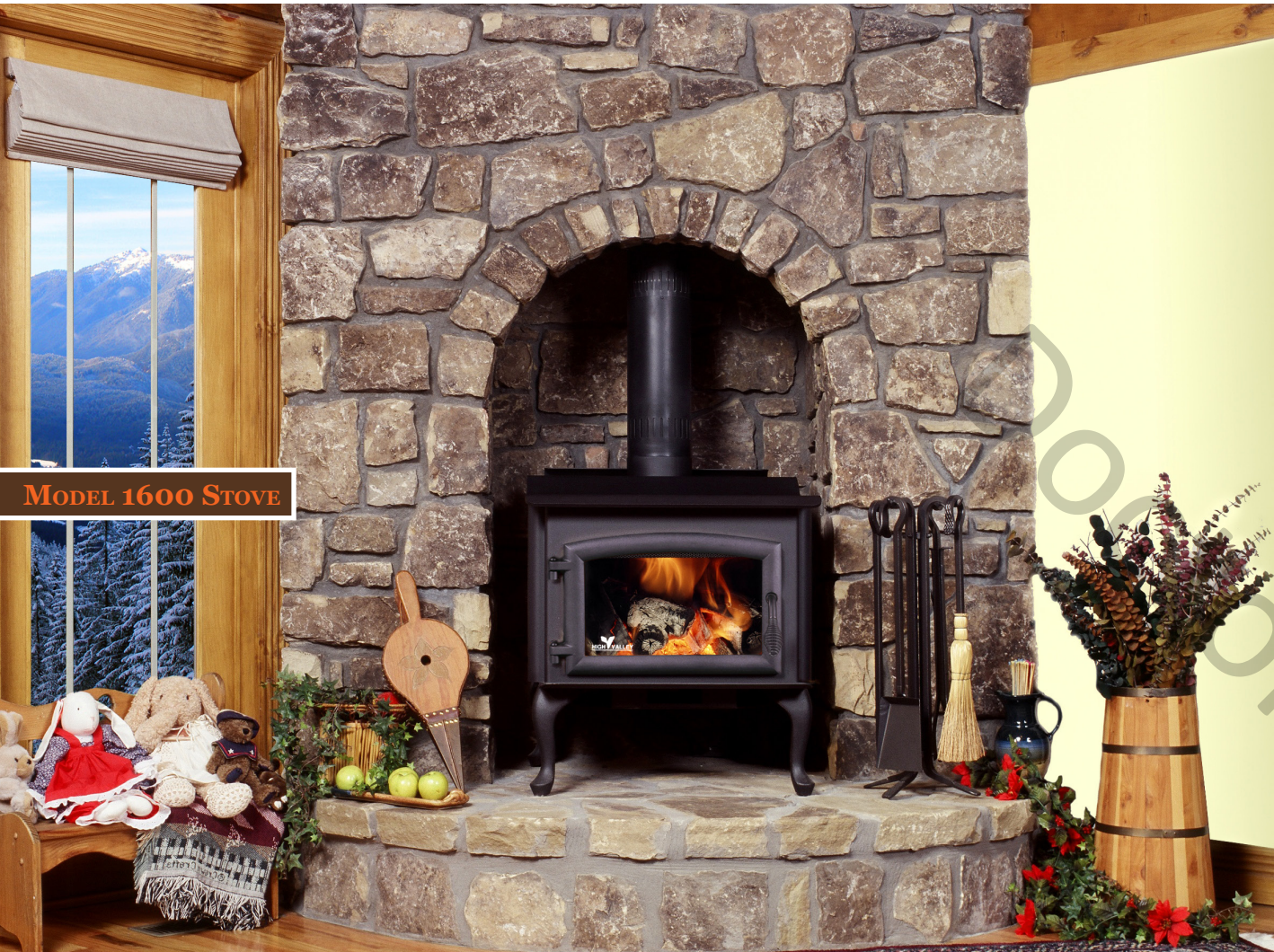
MODEL 1600 STOVE

rich tradition. low emissions. quality build.