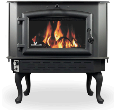
Model 1500 - Shown as Freestanding Stove Also available as a Fireplace Insert

The MODEL 1500 combines excellent performance with compact size, allowing for a wide variety of installations. Configure with a panel kit to make a fireplace insert or with cast iron feet or a steel pedestal to make a free-standing stove.