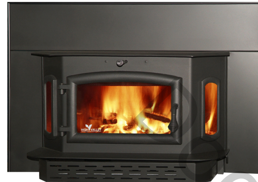
Model 2500 - Shown as Fireplace Insert Also available as a Freestanding Stove

The MODEL 2500 features bay windows which allow more of the fire to be visible, giving the stove very pleasing and warming aesthetics. This model is catalytic based, and can be purchased as a fireplace insert or as a freestanding wood stove.