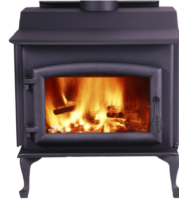
Model 1600 - Shown as Top Flue Vent Also available as Rear Flue Vent

High Valley's MODEL 1600 is a non-catalytic stove that can be configured as a top or rear vent, freestanding, wood stove. Flexibility with wood quality and type allow the 1600 to be a great heater with minimal upkeep. Exceeds the Washington state standard for emissions.