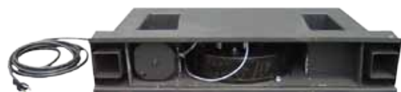
Outlet | Heat Exchanger Unit | Outlet

Capture escaping heat from your gas or wood fireplace by installing a Heat Exchanger. Unique, top-mounted design allows for easy installation over an existing gas log set.