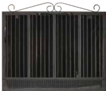
Original Stoll Screen